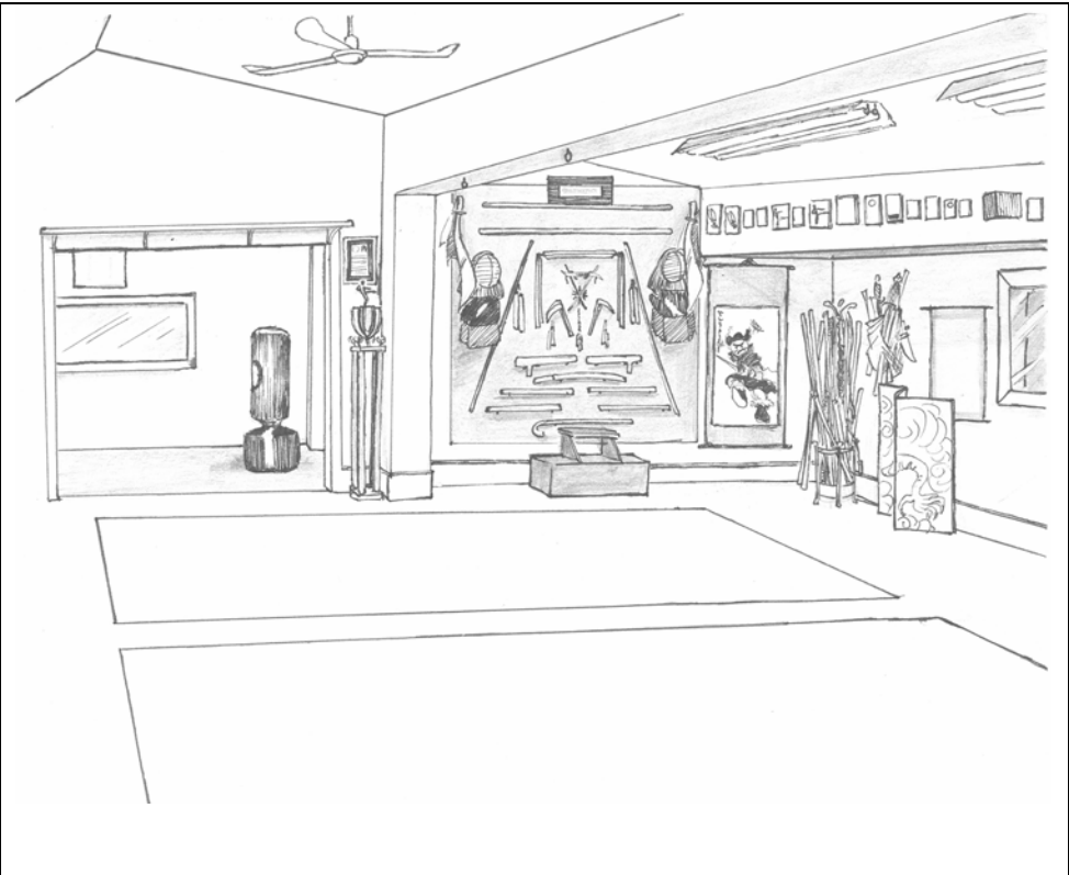
Interior View of the Hallowell Dojo (drawing by Sorah Wismer)